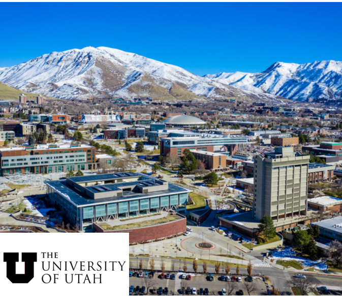
UNIVERSITY OF UTAH