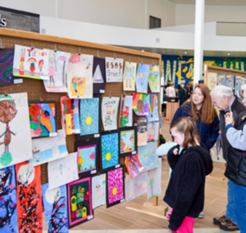
COMMUNITY ART SHOW