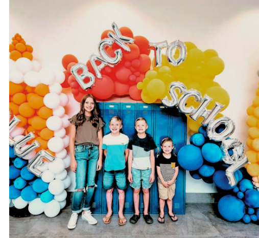
BACK TO SCHOOL CONTEST