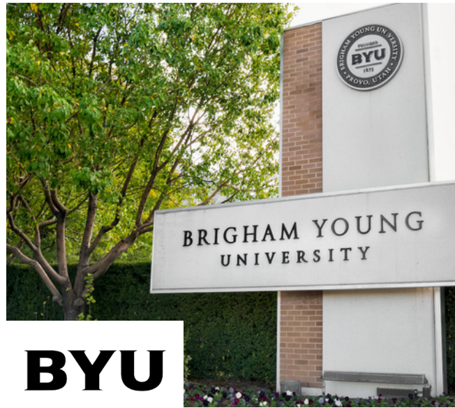
BRIGHAM YOUNG UNIVERSITY