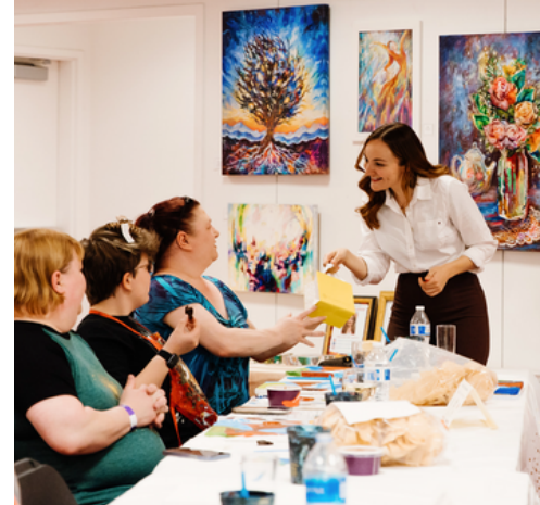
MOM'S NIGHT OUT